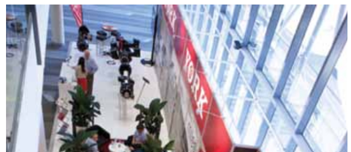
A new York stands out at Brisbane Truck Show, with York's 12 tonne Global Premium Trailer Axle stealing the show.