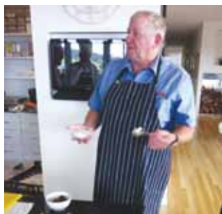
Dan from Western Australia got a little too excited while using pink rock salt as a garnish – almost covering the barbecued chicken!