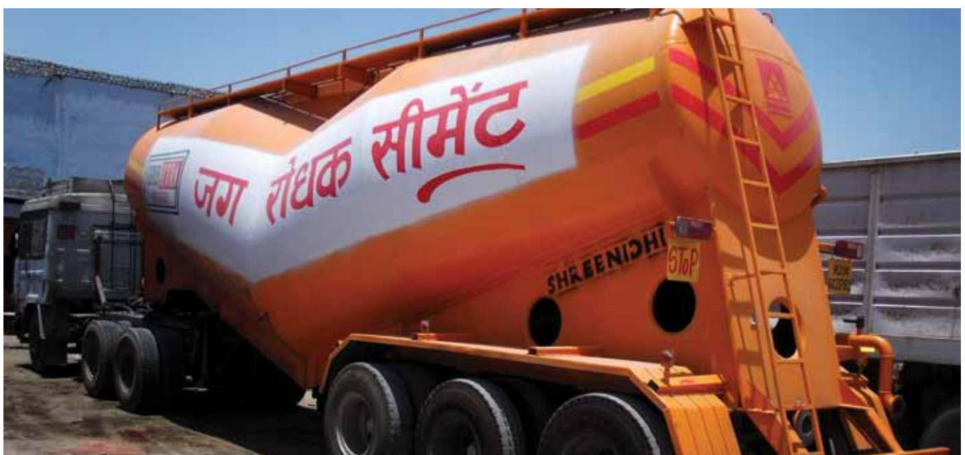
York 5025 axles go the distance for Tanushree Logistics bulk tankers.

Another reason York is proud of its association with Tanushree Logistics is the company's commitment to the welfare of its staff. Apart from regular technical guidance and training for drivers Tanushree Logistics