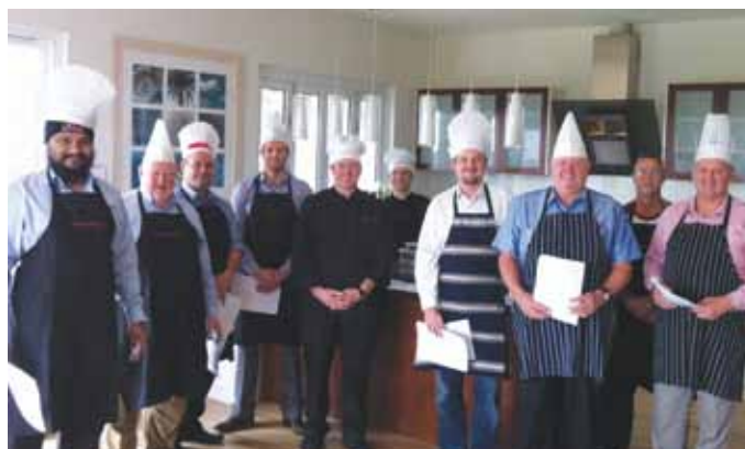
Ready, steady, cook – two teams get ready to face off in the kitchen.

This team building experience was a wonderful way to end a very successful meeting. The gentlemen, many of which had never cooked before, did a marvellous job to produce some very tasty meals.