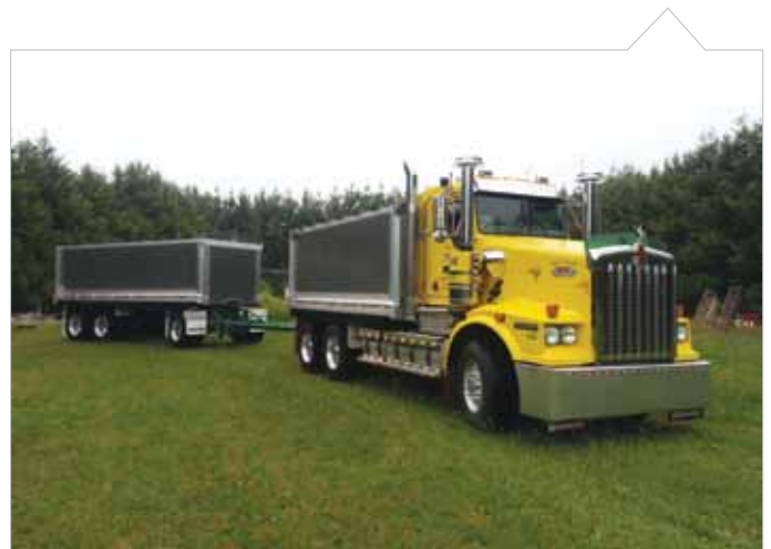
Strength gains are fused with weight advantages for Camilleri's trailers.

"Personally, I like the ease of maintenance with York. More importantly, the drivers really like the stability out on the road."