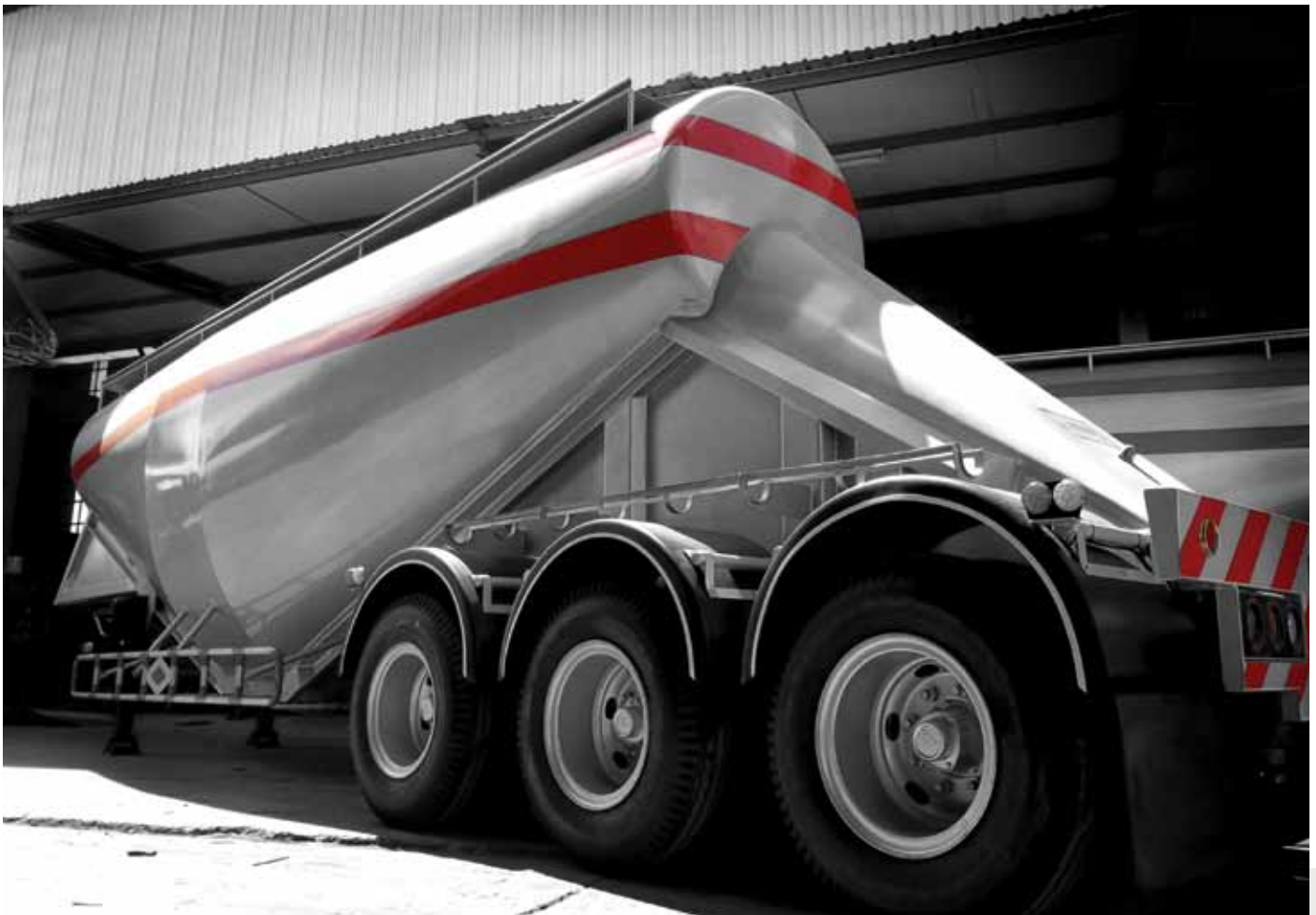
In 2012–2013 alone, more than 300 Channakorn semi-trailer cement tankers were built with York products.