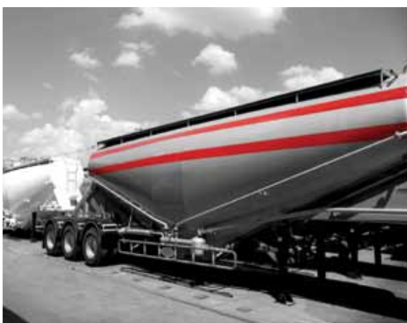
York’s TECAIR 1 suspension reduces weight and adds stability for Bangkok-based, Channakorn Engineering.

“The reason Channakorn Engineering recommends York axles and suspensions is clear: the quality.”