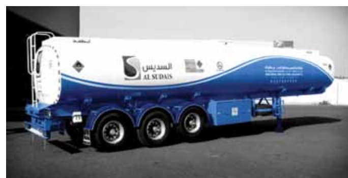
York axles have performed extremely well for Al Sudais under very trying conditions.