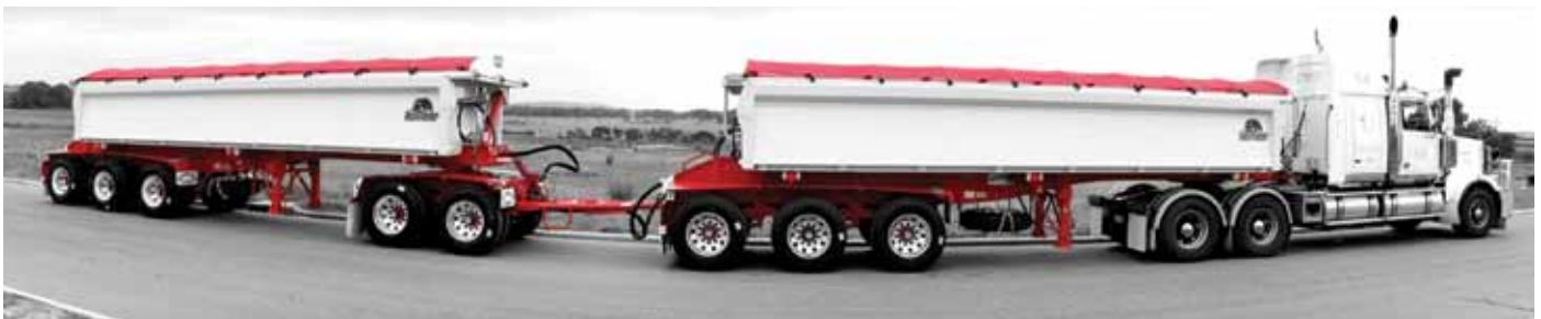
Allroad's Rockwheeler range of side tipper features 350-grade steel chassis and Hardox sides (stiffened with Hardox pressing), floors and doors. Every trailer is road train rated, with the bodies built separate from the chassis and both bead-blasted before priming. Suspensions are another vital part of the Allroads approach, which is why they choose York.

“The link with York is critical in Allroads making our mark on the road transport industry.”