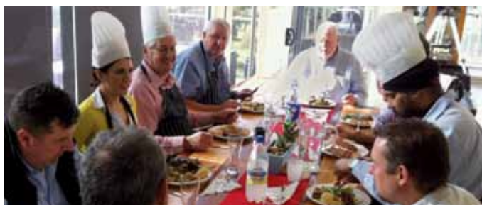
Sitting down for a lovely meal at the end of a very successful two days of training.