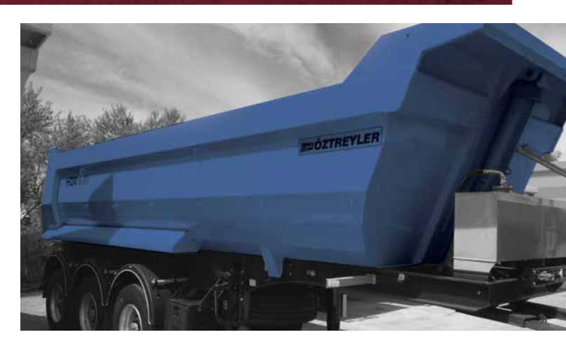
FROM STRENGTH TO STRENGTH; THE OZTREYLERS STORY