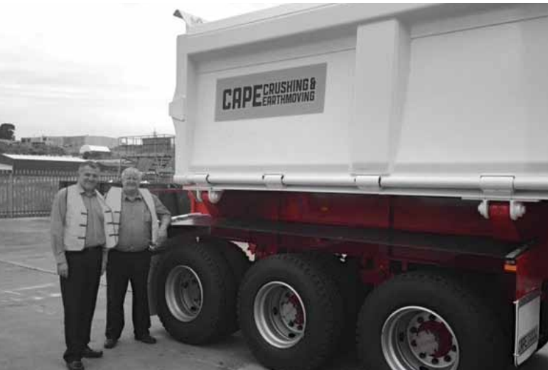
York's axles and suspensions are proving particularly well suited to the challenging environment found in north-west Australia.

Western Australian trailer manufacturer Howard Porter has teamed up with York to build Australia's longest road trains. The 60 metre 'Super Quads' are undergoing State Government approval to start operating in Western Australia's Pilbara region. If the results of early trials are any guide, these amazing builds will not only boost productivity but reduce the number of vehicles on the road.