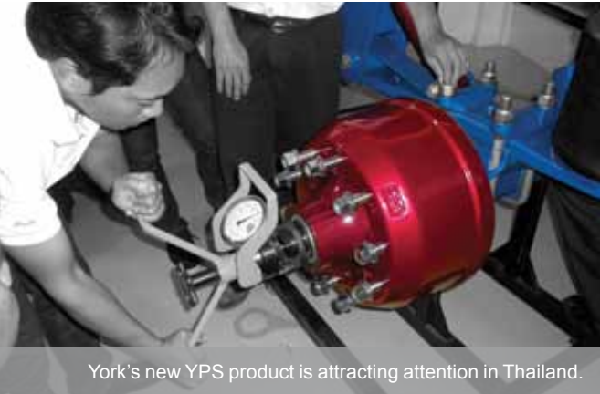
York's new YPS product is attracting attention in Thailand.