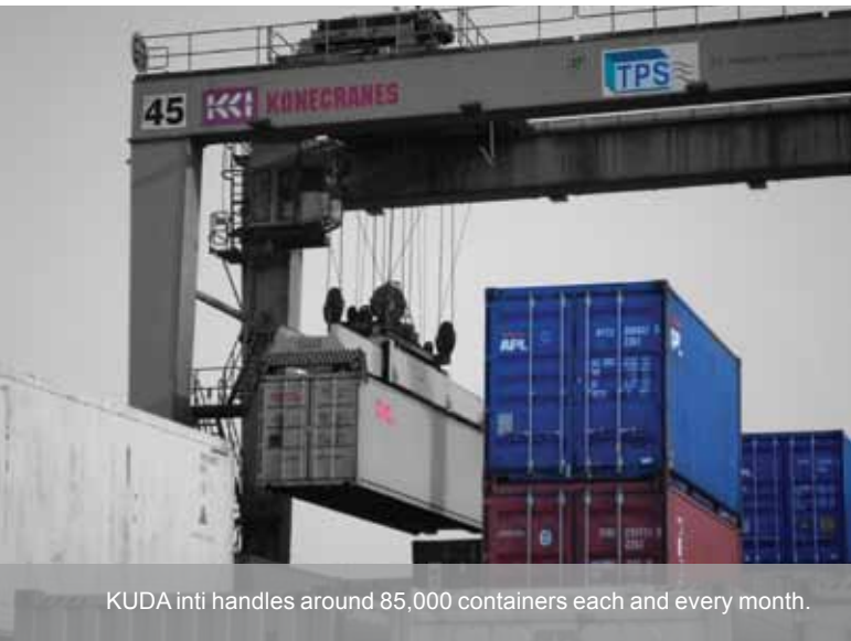
KUDA inti handles around 85,000 containers each and every month.

It's the right choice to continue using York for our port operation at Surabaya.